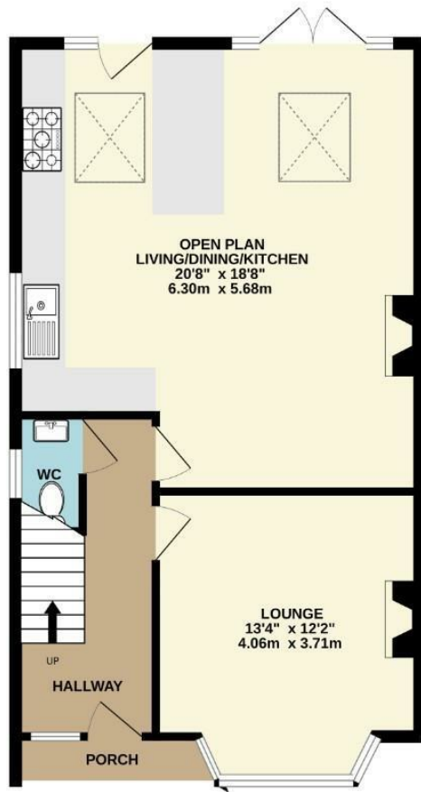
GROUND FLOOR 630 sq.ft. (58.5 sq.m.) approx.